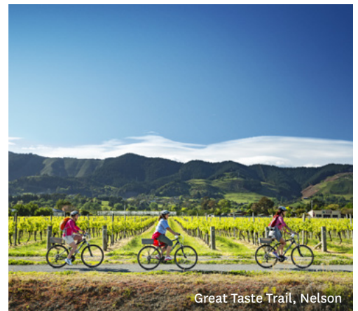
Great Taste Trail, Nelson