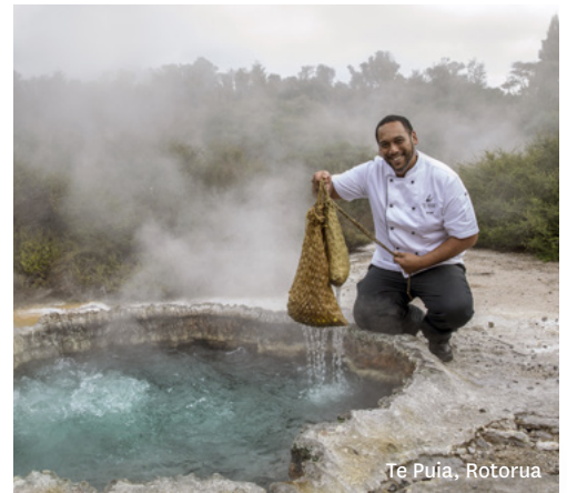
Te Puia, Rotorua