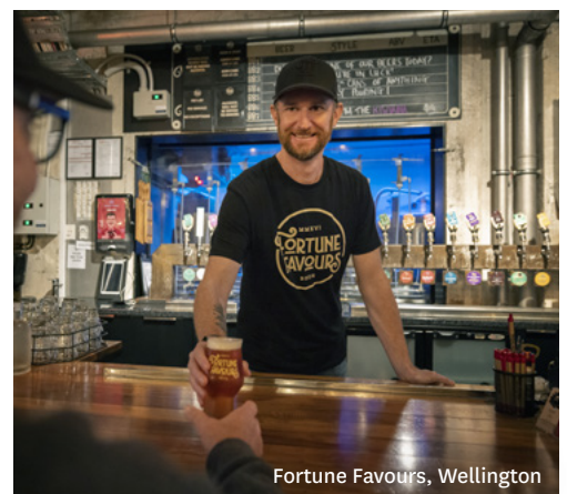
Fortune Favours, Wellington