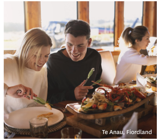
Te Anau, Fiordland

If the craft beer scene is something that excites you, Te Whanganui-a-Tara (Wellington) should be on your destination list. A walking tour with a passionate imbiber is the best way to find those hidden gems. Meet the brewers and get a behind-the-scenes look at how these microbreweries are changing the cityscape, traditionally known for great coffee.