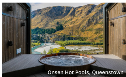
Onsen Hot Pools, Queenstown