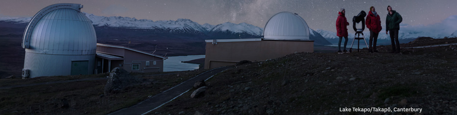
Lake Tekapo/Takapō, Canterbury

Who said winter must-dos have to be all about skiing and snowboarding? From indulgent hot pool soaks and nights spent under the stars to memorable wildlife encounters, there are plenty of winter activities in Aotearoa New Zealand beyond the slopes.