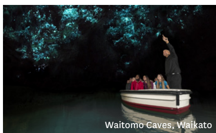
Waitomo Caves, Waikato