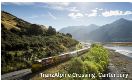
TranzAlpine Crossing, Canterbury

What could make the thrill of skiing or the deliciousness of gin tasting even better? How about a scenic helicopter ride! Several operators throughout the South Island offer exclusive heli experiences including heli-skiing across the dramatic backcountry terrain of the Southern Alps. Or embark on a unique imbibing experience with a heli-gin tour , where you can enjoy a tipples (or two) while taking in panoramic mountain views.