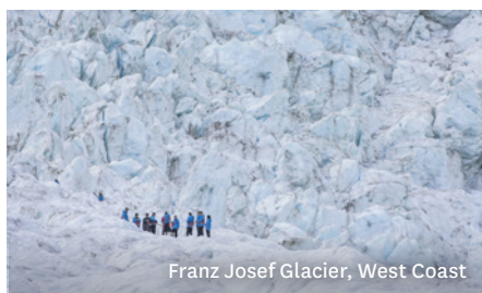
Franz Josef Glacier, West Coast

Seeing the country’s unique wildlife is often considered a highlight of travelling to New Zealand. Spot the critically endangered Bryde’s whale on an eco-tour in the Hauraki Gulf Marine Park. Spy the rare hoiho (yellow-eyed penguin) from a public viewing hide in Southland’s Nugget Point Reserve. Or join Ruggedy Range’s eco-watch experience on Rakiura Stewart Island to seek kiwi in the wild.