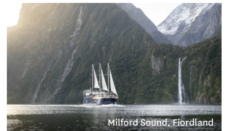
Milford Sound, Fiordland