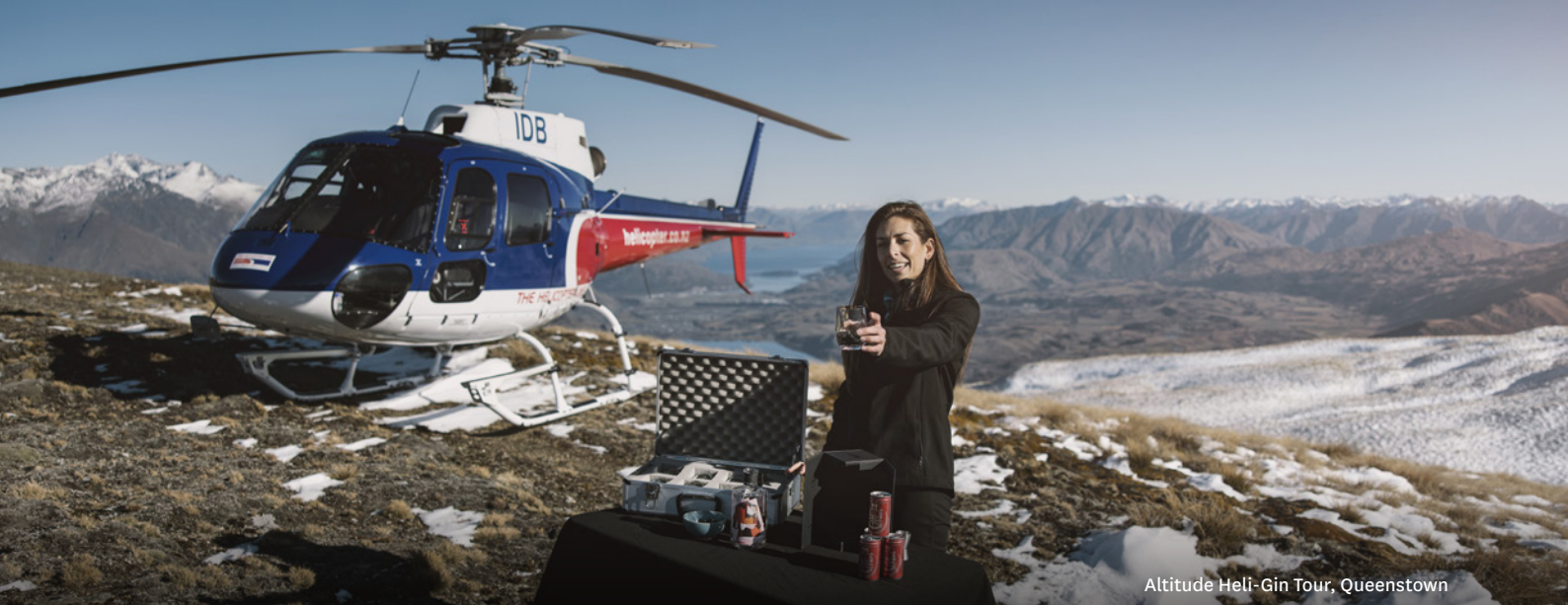
Altitude Heli-Gin Tour, Queenstown