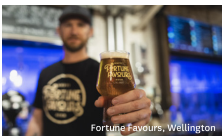
Fortune Favours, Wellington