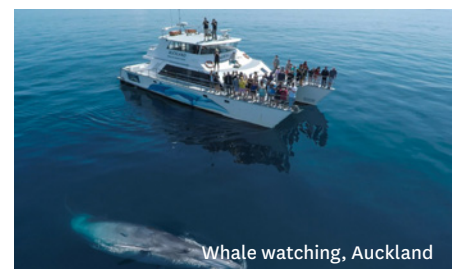
Whale watching, Auckland