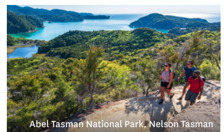
Abel Tasman National Park, Nelson Tasman