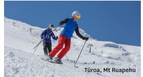
Tūroa, Mt Ruapehu