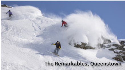
The Remarkables, Queenstown