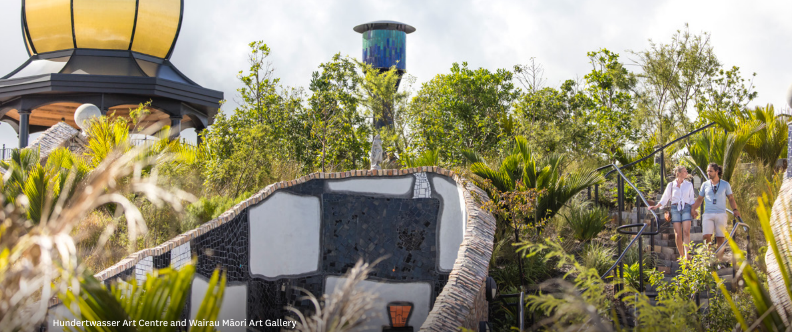
Hundertwasser Art Centre and Wairau Māori Art Gallery