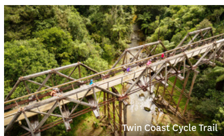
Twin Coast Cycle Trail