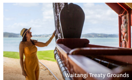
Waitangi Treaty Grounds