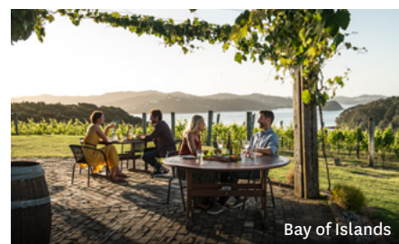
Bay of Islands