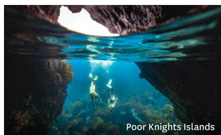
Poor Knights Islands

Sample the best of Taitokerau Northland's hospitality and subtropical produce, enjoying fresh seafood, local wines and gourmet cuisine of the many wineries, produce stalls, and farmers markets on one of these food and beverage itineraries . Be sure to enjoy a beer or wine at the famous Duke of Marlborough bar & restaurant New Zealand's oldest licenced hotel, in the charming seaside town of Russell, just a short ferry over from Paihia.