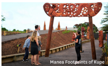
Manea Footprints of Kupe

Visit the spiritual top of Aotearoa New Zealand, where it's believed Māori spirits depart for their final journey, and the Tasman Sea and Pacific Ocean intertwine. Join an off-road tour of Te Oneroa a Tōhē Ninety Mile Beach with Fullers GreatSights . Or view all the beauty from above with Salt Air .