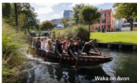
Waka on Avon