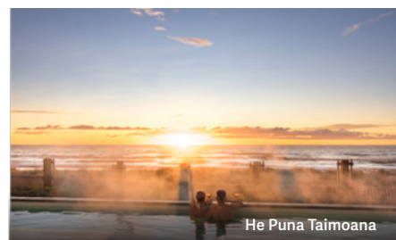
He Puna Taimoana