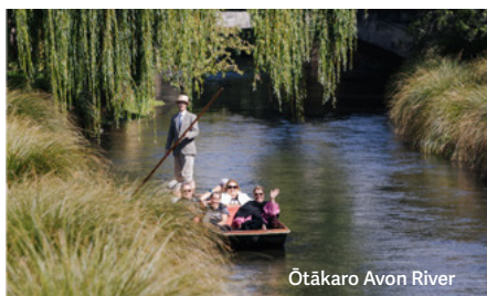
Ōtākaro Avon River