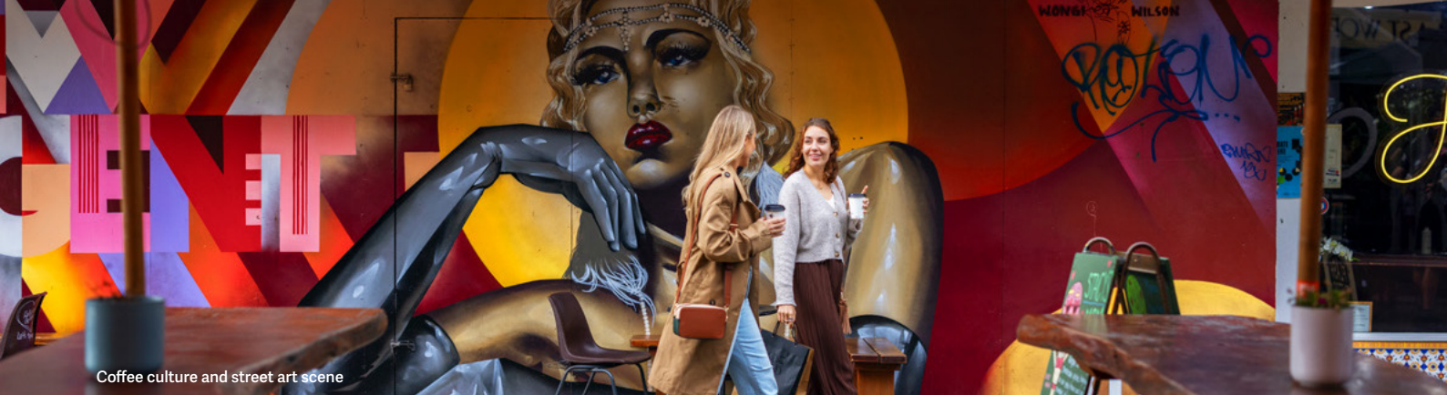
Coffee culture and street art scene