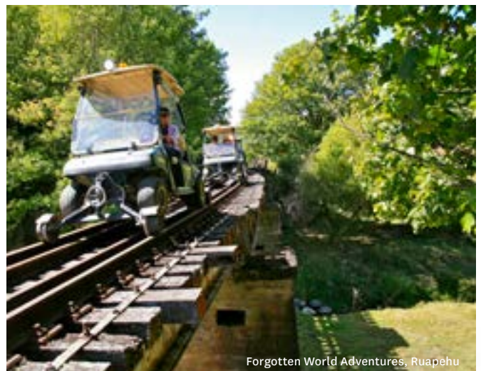
Forgotten World Adventures, Ruapehu

Expert Tip: Are your clients after chalet-style accommodation with an underground pool, and a bar where dancing on the tables is encouraged? Book Ohakune's Powderhorn Chateau for a luxe stay.