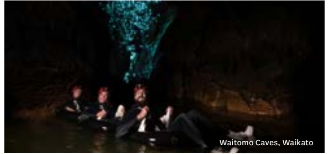
Waitomo Caves, Waikato

Expert Tip: Are your clients keen to flaunt the black jersey and get some hands-on learning about rugby, our national sport? Check out the All Blacks Experience at Auckland's Sky City.