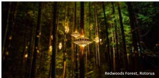
Redwoods Forest, Rotorua