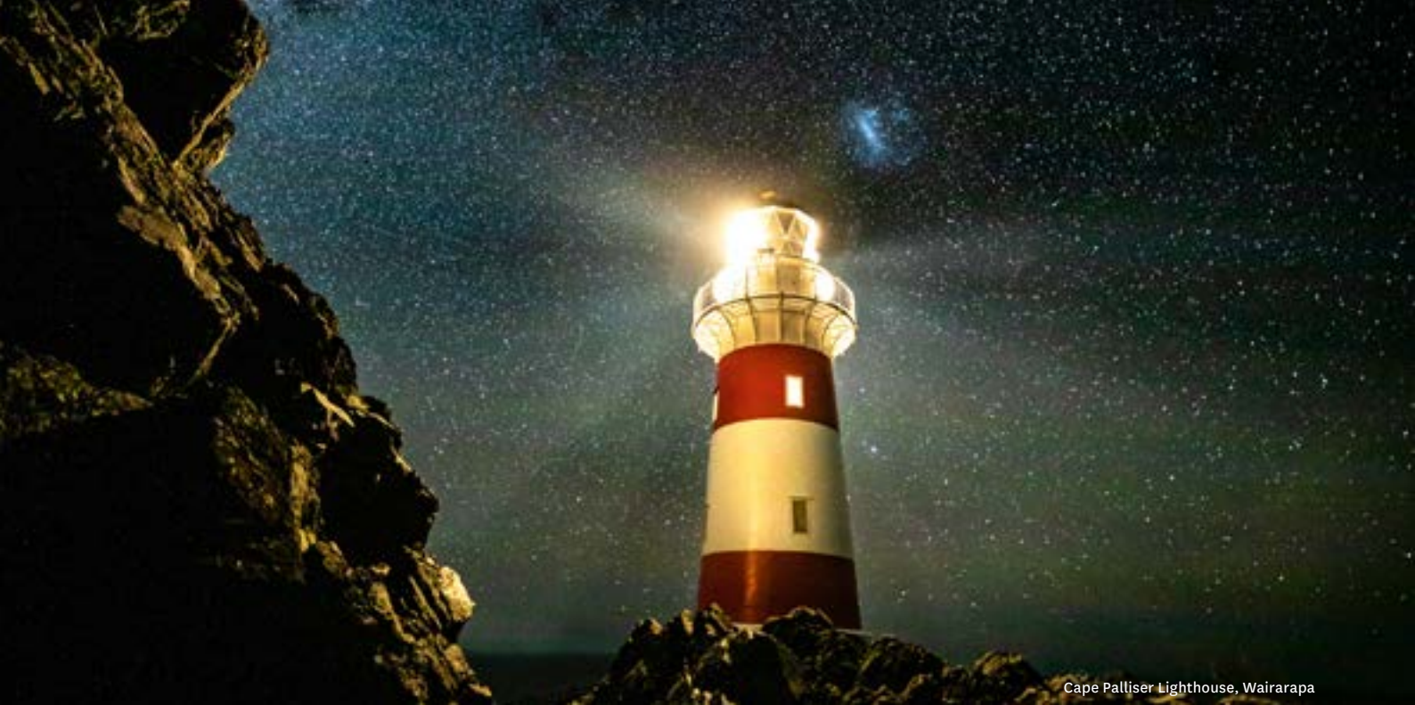
Cape Palliser Lighthouse, Wairarapa