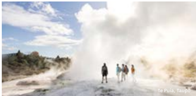
Te Puia, Taupō