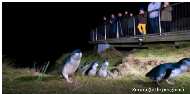
Kororā (little penguins)