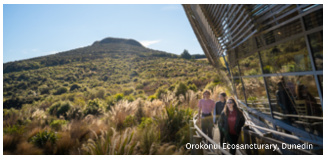
Orokonui Ecosanctuary, Dunedin