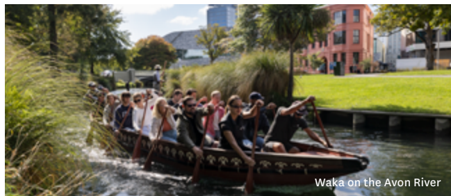
Waka on the Avon River

Expert tip: Āmiki Tours epitomise the meaning of manaakitanga (hospitality) and offer a local's view of Ōtautahi. An Āmiki Tour combines Māori storytelling, history and city sights with kai (food) and whanaungatanga (connection).