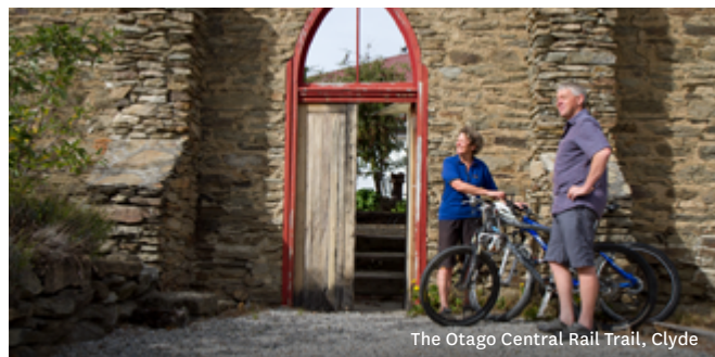
The Otago Central Rail Trail, Clyde