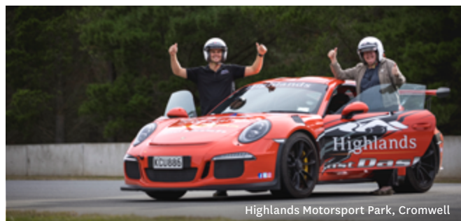
Highlands Motorsport Park, Cromwell

A quick five minute drive south-east lies a town with strong roots to the 1800's gold era. To transport back in time, follow gold miner's trails into the hills of Alexandra. Today, Alex (as it is affectionately called by locals) is home to bountiful orchards and award-winning vineyards. In winter, visitors can even go ice skating on Manorburn dam.