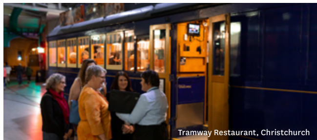
Tramway Restaurant, Christchurch