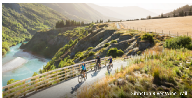
Gibbston River Wine Trail