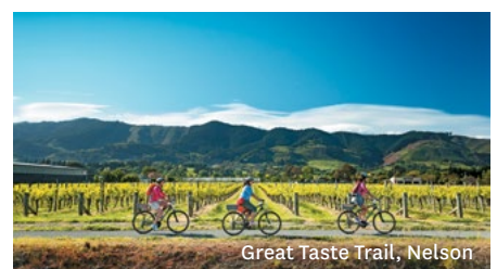
Great Taste Trail, Nelson