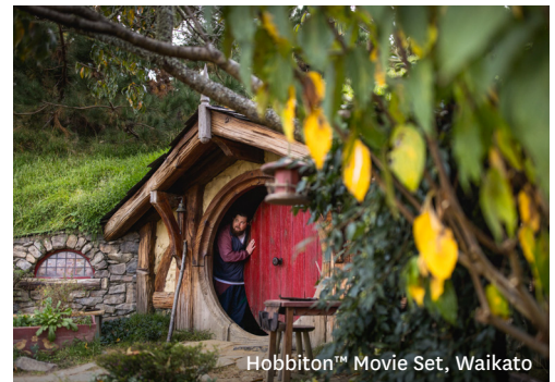
Hobbiton™ Movie Set, Waikato