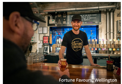
Fortune Favours, Wellington