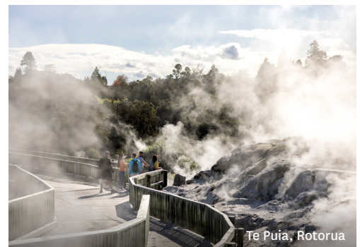
Te Puia, Rotorua