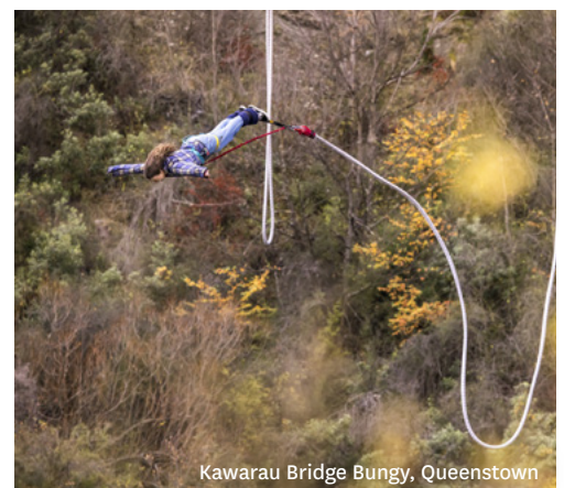
Kawarau Bridge Bungy, Queenstown