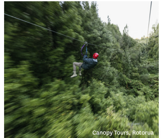
Canopy Tours, Rotorua