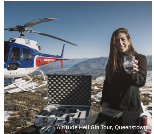
Altitude Heli Gin Tour, Queenstown

Is it really a trip to New Zealand without strapping a cord around your ankles and taking that heart-stopping leap of faith? Bungy jump from bridges, ledges, platforms perched on cliffs, over canyons, and even off the tallest tower in Auckland. Awaken that adventurer inside and take the plunge.