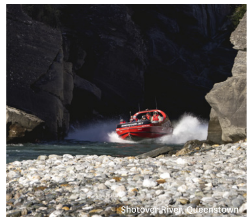
Shotover River, Queenstown