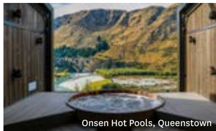
Onsen Hot Pools, Queenstown