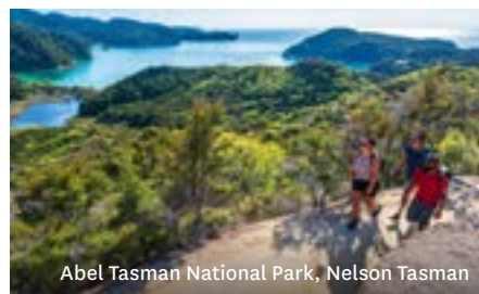
Abel Tasman National Park, Nelson Tasman