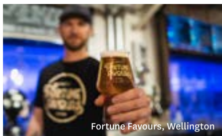
Fortune Favours, Wellington