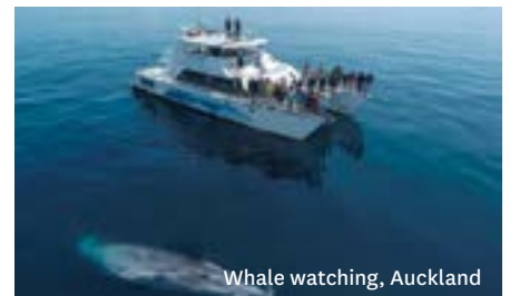
Whale watching, Auckland