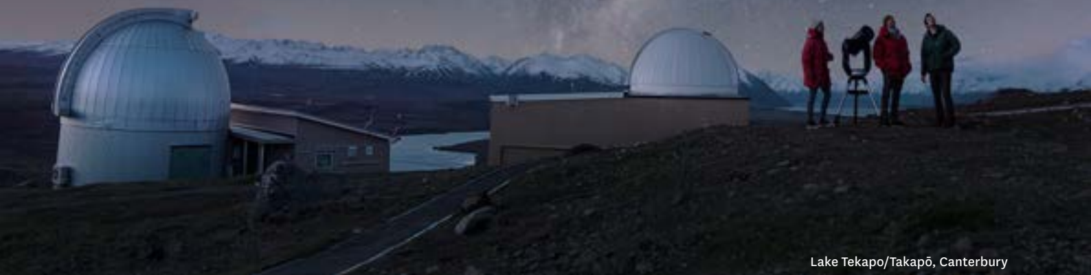
Lake Tekapo/Takapō, Canterbury

Who said winter must-dos have to be all about skiing and snowboarding? From indulgent hot pool soaks and nights spent under the stars to memorable wildlife encounters, there are plenty of winter activities in Aotearoa New Zealand beyond the slopes.