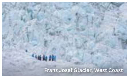
Franz Josef Glacier, West Coast

Seeing the country’s unique wildlife is often considered a highlight of travelling to New Zealand. Spot the critically endangered Bryde’s whale on an eco-tour in the Hauraki Gulf Marine Park. Spy the rare hoiho (yellow-eyed penguin) from a public viewing hide in Clutha’s Nugget Point Reserve. Or join Ruggedy Range’s eco-watch experience on Rakiura Stewart Island to seek kiwi in the wild.