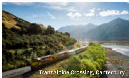
TranzAlpine Crossing, Canterbury

What could make the thrill of skiing or the deliciousness of gin tasting even better? How about a scenic helicopter ride! Several operators throughout the South Island offer exclusive heli experiences including heli-skiing across the dramatic backcountry terrain of the Southern Alps. Or embark on a unique imbibing experience with a heli-gin tour , where you can enjoy a tippie (or two) while taking in panoramic mountain views.