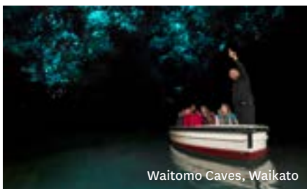
Waitomo Caves, Waikato