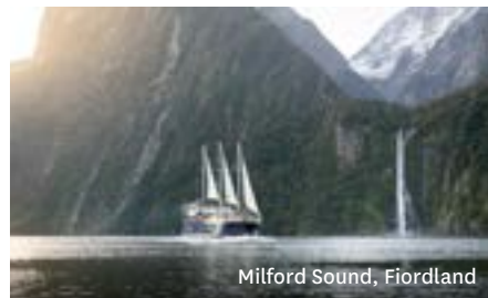
Milford Sound, Fiordland