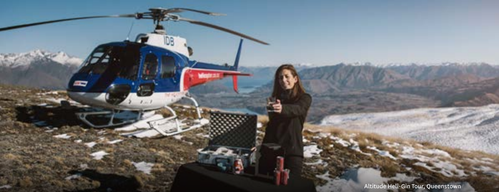
Altitude Heli-Gin Tour, Queenstown