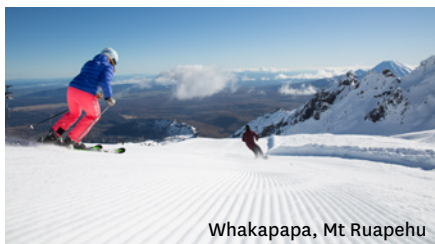
Whakapapa, Mt Ruapehu