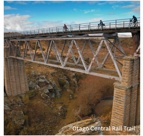
Otago Central Rail Trail