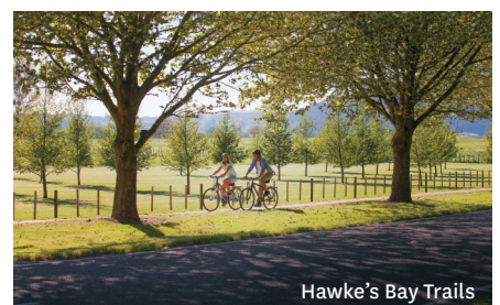
Hawke's Bay Trails