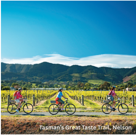
Tasman's Great Taste Trail, Nelson