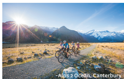
Alps 2 Ocean, Canterbury