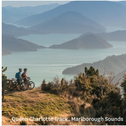
Queen Charlotte Track, Marlborough Sounds