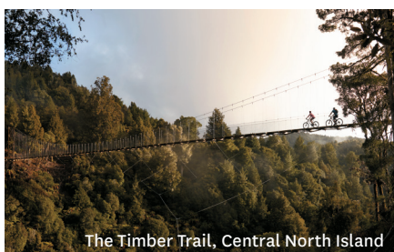
The Timber Trail, Central North Island

Suitable for experienced cyclists with good skills, and a high level of fitness. Off-road trails are narrow with steep climbs and unavoidable obstacles. Hill climbs and possible gravel sections.