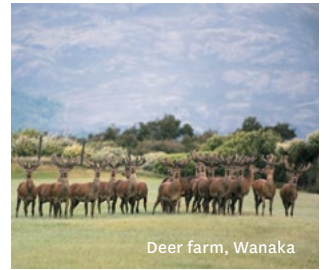
Deer farm, Wanaka

Explore the private high-country farm stations around Wanaka for a hands-on introduction to deer farming, beekeeping and authentic Kiwi farm life. This afternoon explore Arrowtown on a walking tour, a charming gold rush village nestled below craggy peaks. Then head to Queenstown and enjoy a tour of the local award-winning wineries, tasting as you go.