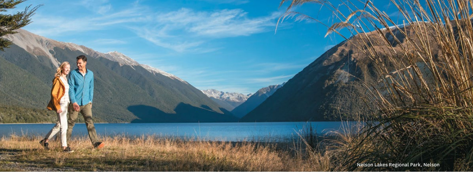
Nelson Lakes Regional Park, Nelson