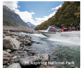
Mt Aspiring National Park

Begin your morning with a lake cruise and guided nature walk on Mou Waho island, where you can spot the rare flightless Buff Weka. After lunch, go jet boating amongst the ancient river valleys and snow-capped mountains of the Mt Aspiring National Park – a UNESCO World Heritage Area.