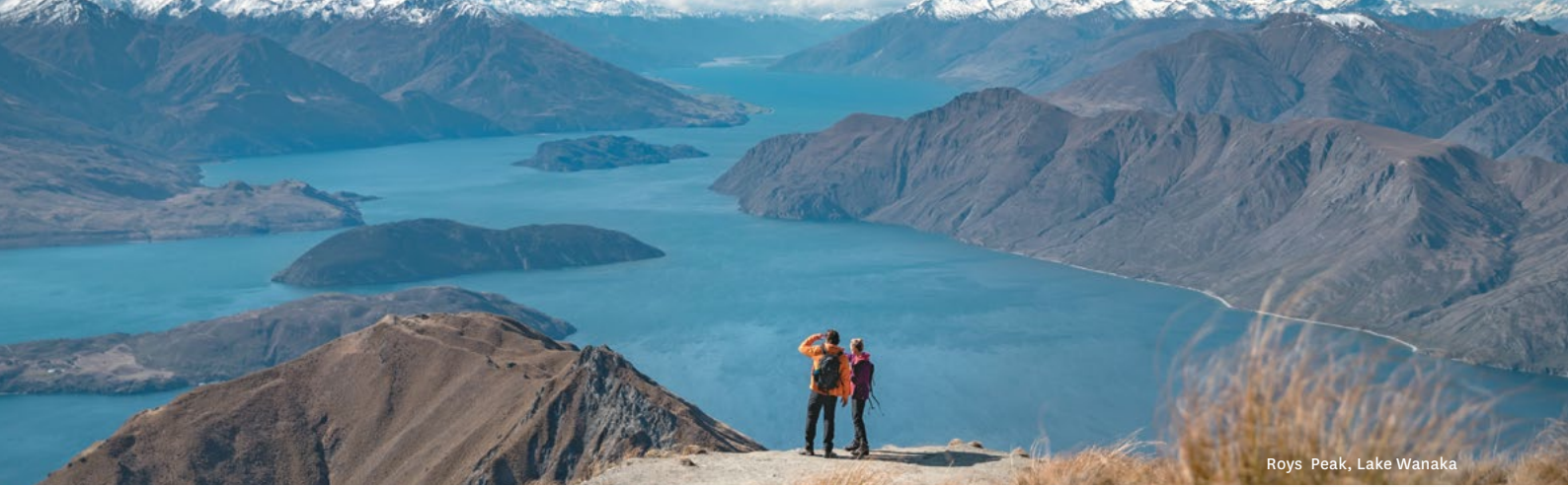
Roys Peak, Lake Wanaka