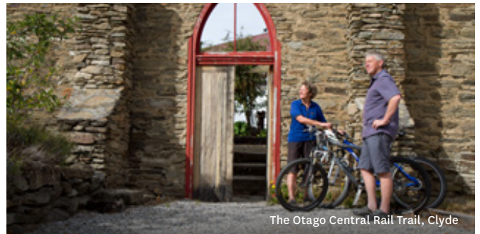
The Otago Central Rail Trail, Clyde