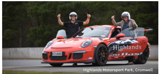
Highlands Motorsport Park, Cromwell

A quick five minute drive south-east lies a town with strong roots to the 1800's gold era. To transport back in time, follow gold miner's trails into the hills of Alexandra. Today, Alex (as it is affectionately called by locals) is home to bountiful orchards and award-winning vineyards. In winter, visitors can even go ice skating on Manorburn dam.