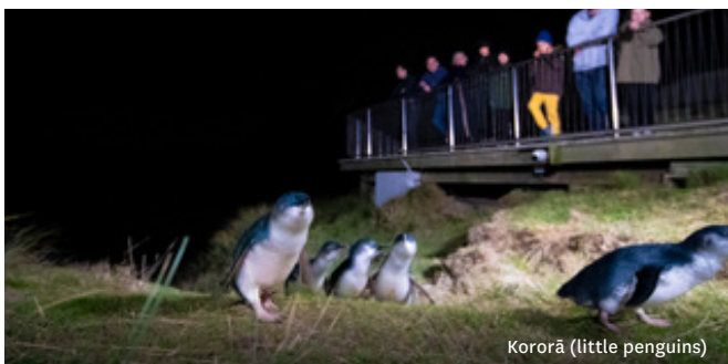
Kororā (little penguins)