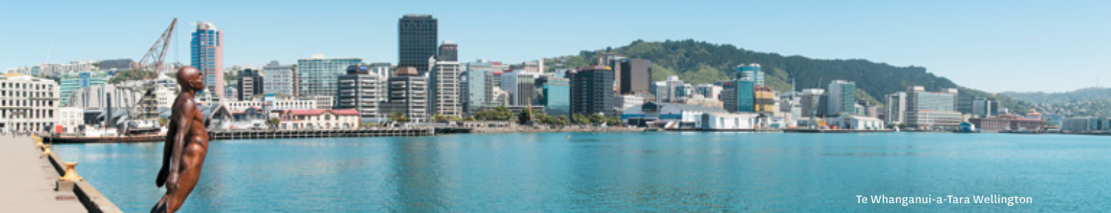
Te Whanganui-a-Tara Wellington