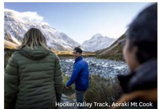
Hooker Valley Track, Aoraki Mt Cook