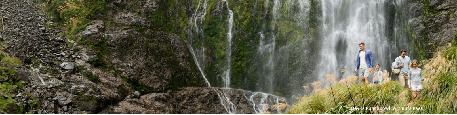
Devils Punchbowl, Arthur's Pass