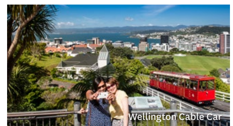
Wellington Cable Car