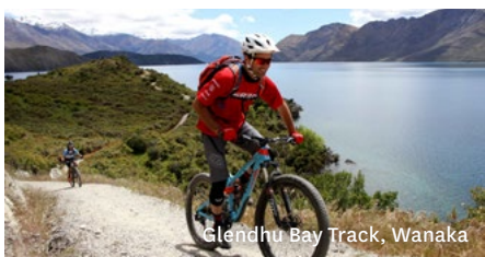
Glendhu Bay Track, Wanaka

Jet boat into the heart of Mount Aspiring National Park.