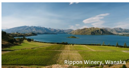
Rippon Winery, Wanaka