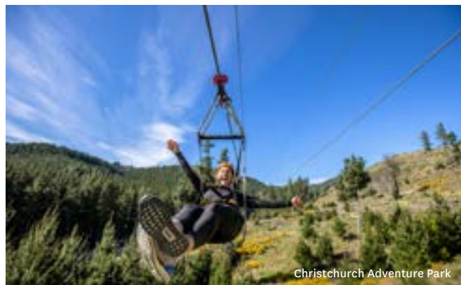
Christchurch Adventure Park

Choose to stay city-side at upscale hotels such as The George or Hotel Montreal . Or venture inland to opulent Flockhill Alpine Lodge , in the Canterbury high country.