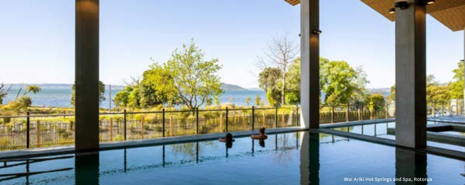
Wai Ariki Hot Springs and Spa, Rotorua