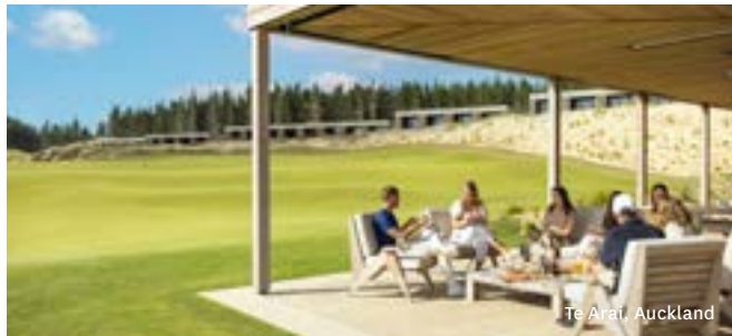
Te Arāi, Auckland

Accommodation options in Auckland and surrounds are plentiful.