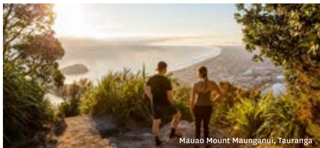
Mauao Mount Maunganui, Tauranga

Take a boat cruise to Moutohorā Island , an island sanctuary for rare and native bird species. Swim at secluded Onepū Sulphur Bay or dig your own hot water pool, naturally fed from the hot water spring beneath the golden sand beach. Paddleboard or kayak to breathtaking Whenuakura Island and marvel at the impossibly clear azure waters of this hidden local gem.