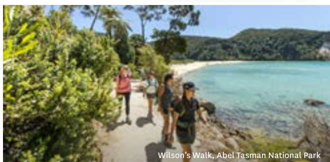
Wilson's Walk, Abel Tasman National Park