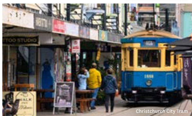
Christchurch City Tram