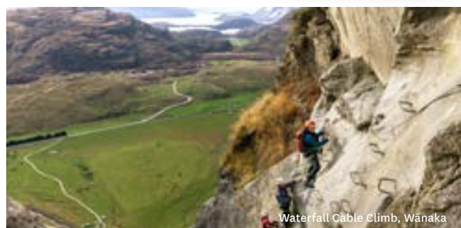
Waterfall Cable Climb, Wānaka