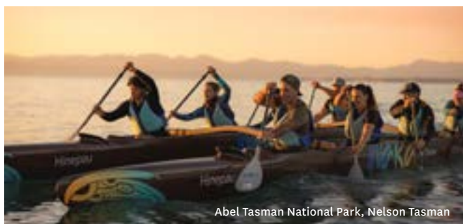
Abel Tasman National Park, Nelson Tasman