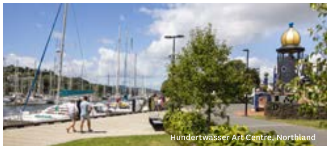
Hundertwasser Art Centre, Northland