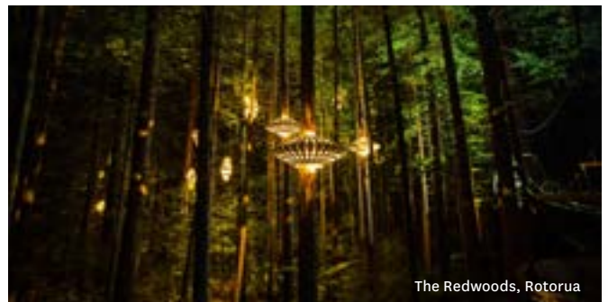
The Redwoods, Rotorua