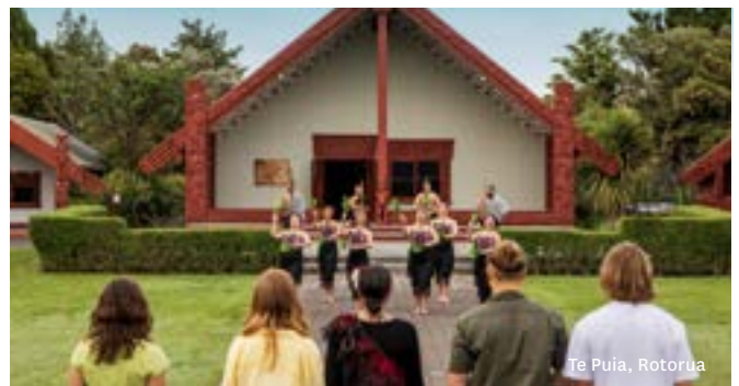
Te Puia, Rotorua

Stay at Treetops Lodge and Estate just a short drive from the city or enjoy expansive water views at On the Point Lake Rotorua .