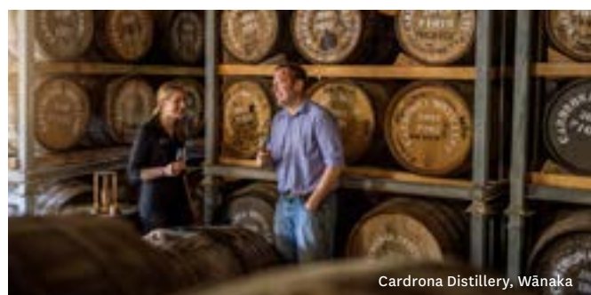
Cardrona Distillery, Wānaka