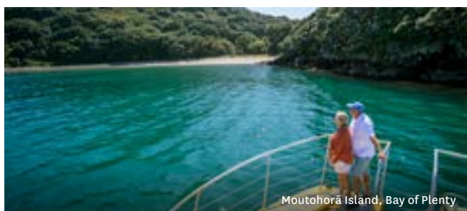
Moutohorā Island, Bay of Plenty