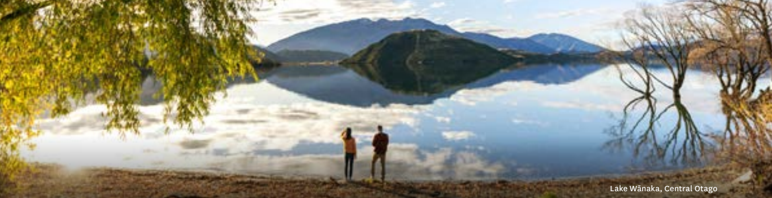
Lake Wānaka, Central Otago