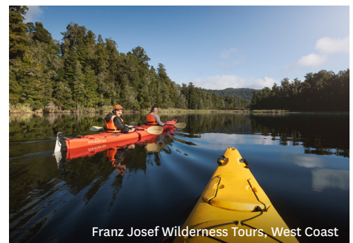
Franz Josef Wilderness Tours, West Coast