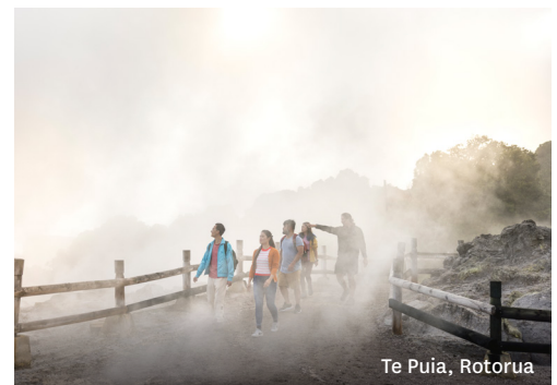
Te Puia, Rotorua