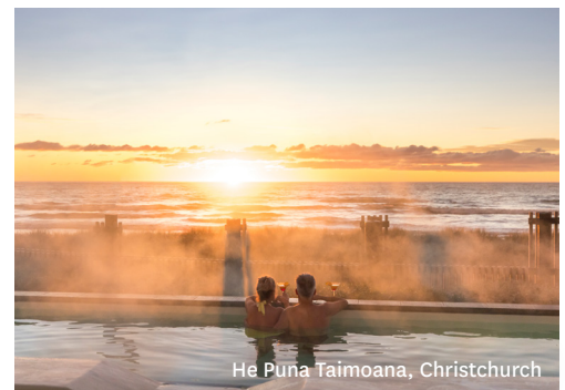
He Puna Taimoana, Christchurch