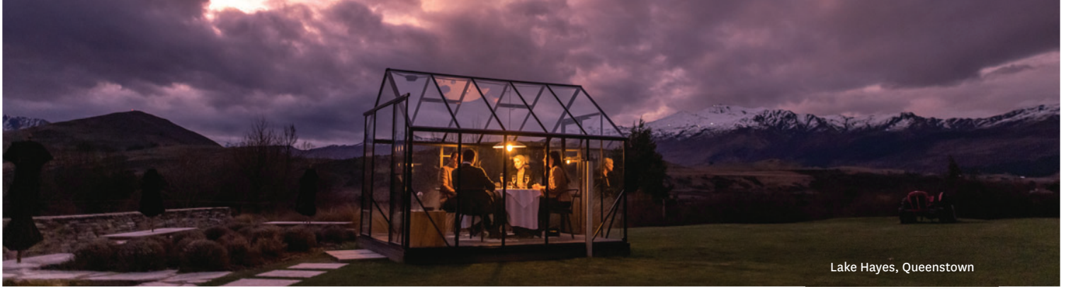
Lake Hayes, Queenstown