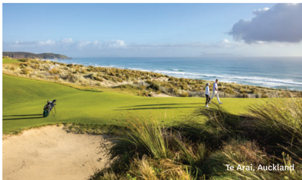
Te Arai, Auckland

GOLF – With around 400 golf courses across the motu (country), New Zealand has the world's second highest ratio of golf courses per capita! Varying in character and style, while making the most of the natural topography, expect classical coastal links and traditional parkland courses, as well as courses designed by the likes of Jack Nicklaus and Robert Trent Jones Jnr.