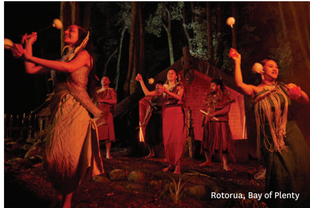
Rotorua, Bay of Plenty