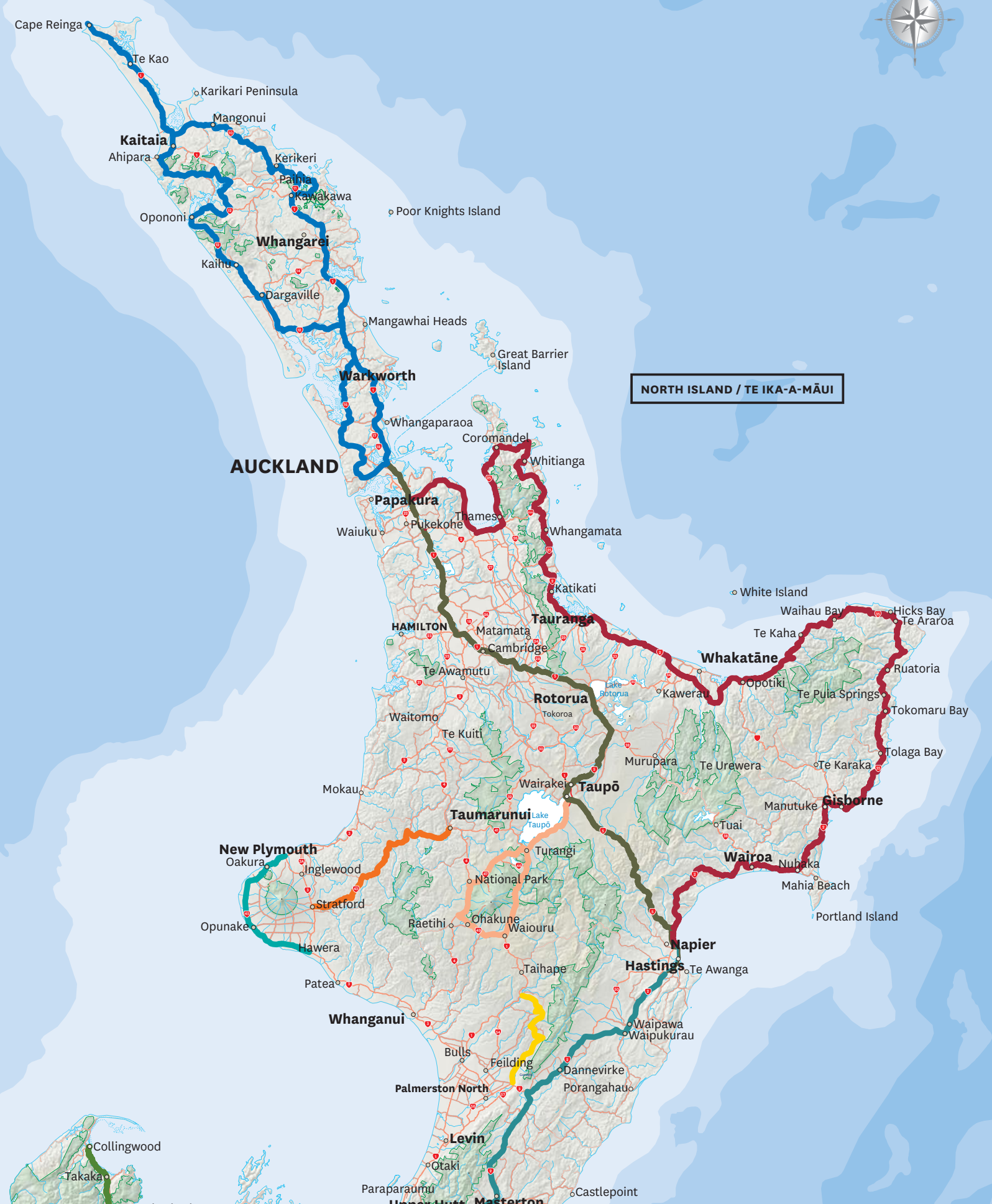
NORTH ISLAND / TE IKA-A-MĀUI