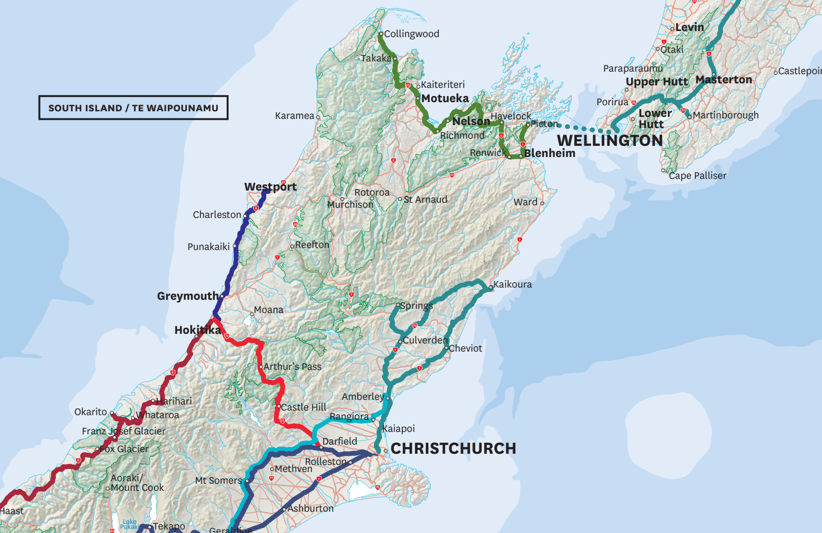
SOUTH ISLAND / TE WAIPOUNAMU