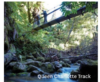
Queen Charlotte Track

Enjoy a slow pace this morning before transferring back to Picton. Board the Coastal Pacific Train, which travels between snow-capped mountains and the sweeping Pacific Ocean. Watch the scenery change drastically and keep your eyes peeled for New Zealand fur seals sunning themselves on the rocks. Tonight, sleep under the stars in a private hideaway glass cabin, or embrace your inner child in a luxury treehouse.