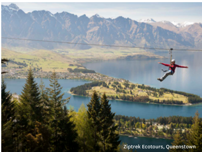
Ziptrek Ecotours, Queenstown