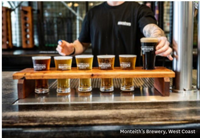
Monteith's Brewery, West Coast

Expert tip: 85% of the region is conservation land, so it's fitting that your clients experience the near-untouched beauty. Waiatoto River Safari will take you on an incredible eco jetboat adventure through the Haast UNESCO World Heritage Area that would otherwise take days on foot.