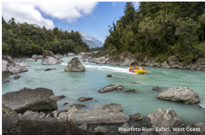
Waiatoto River Safari, West Coast