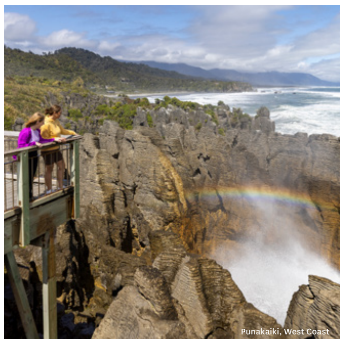
Punakaiki, West Coast