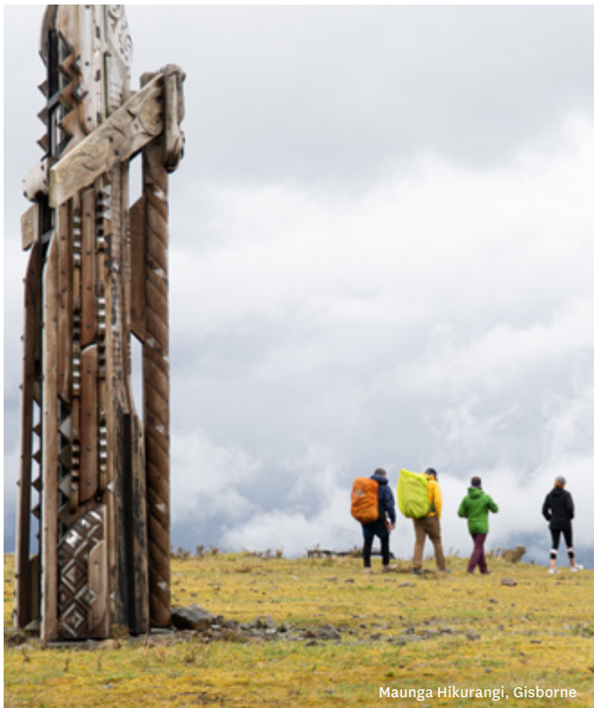
Maunga Hikurangi, Gisborne