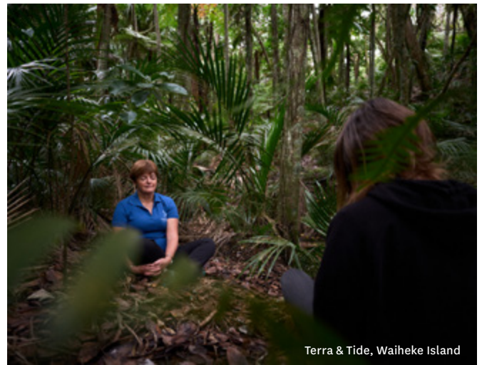
Terra & Tide, Waiheke Island

For a culinary extravaganza, book a Gourmet Food and Wine Tour on Waiheke Island (a 40 minute ferry from central Auckland) with Ananda Tours . Whilst on the island, explore off the beaten track with Terra & Tide . Partake in one of their wellbeing workshops, such as 'forest therapy' or take to the water and discover the Hauraki Gulf by catamaran.