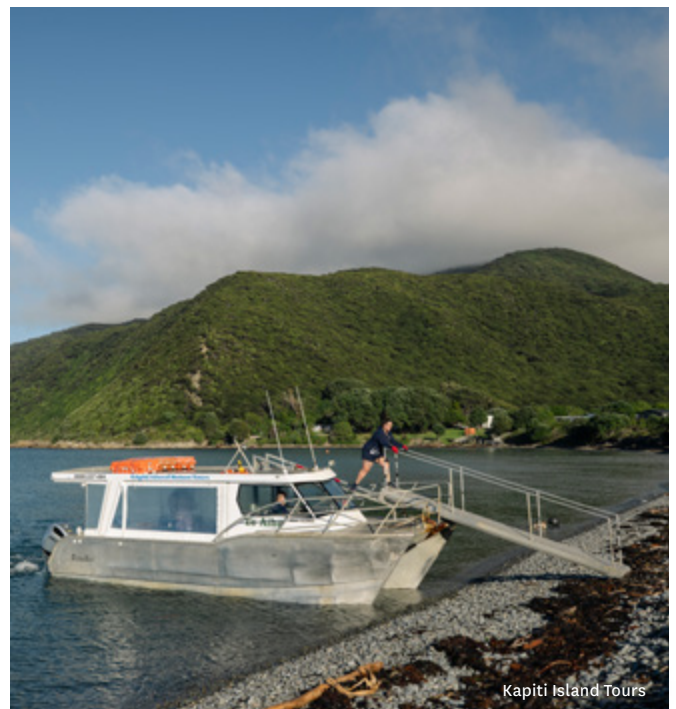
Kapiti Island Tours

The next day, embark on a guided full day tour with Kaewa Tours , over the Remutaka hill to the magnificent wine region of the Wairarapa. Guests will visit artisan food producers, sample world class wines and enjoy the scenic drive to the southernmost point of the North Island, Cape Palliser or the rugged Castlepoint (hopefully spotting some fur seals along the way!)