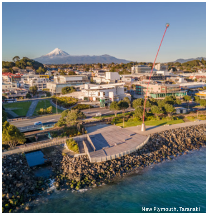
New Plymouth, Taranaki