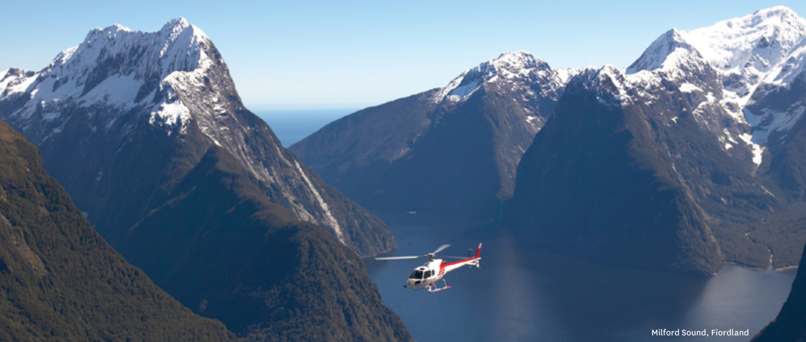
Milford Sound, Fiordland