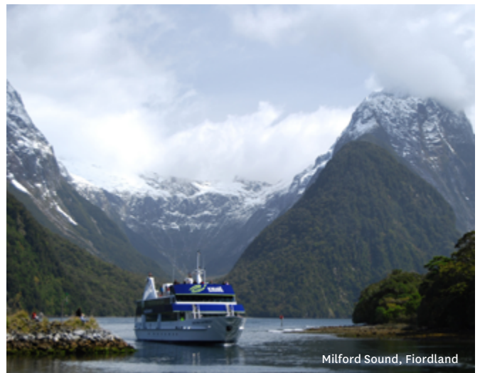
Milford Sound, Fiordland

Embark on a guided cave adventure and cruise across Te Anau lake into limestone caverns and glow-worm grottos. Explore the unique underwater realms of Milford Sound, where deep water species inhabit the shallows with Descend Diving . Go by river and land with a bike and jetboat combo tour , a rare opportunity to explore Fiordland National Park away from the crowds.