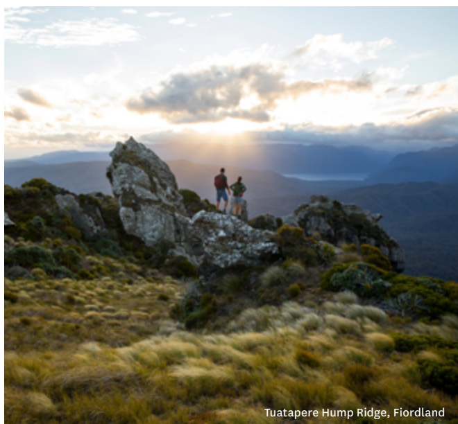
Tuatapere Hump Ridge, Fiordland