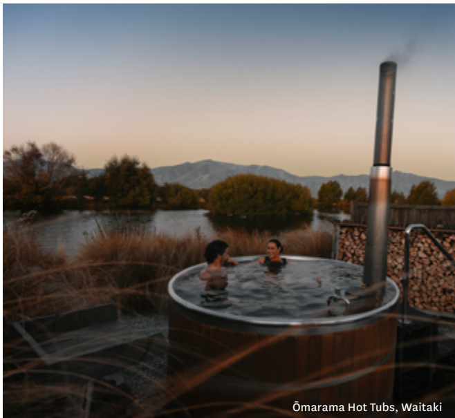
Ōmarama Hot Tubs, Waitaki